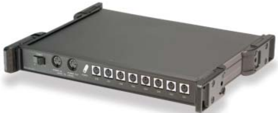
The DBK43A provides eight channels of strain gage input

Input Amplifier. The DBK43A's input amplifiers provide an input gain range of x100 to 1250. Because input signals can vary widely in range, the DBK43A's extensive range is a superior alternative to fixed-gain or slot-range amplifiers.