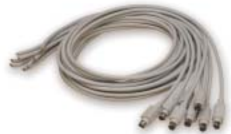
CA-132, eight strain gage cables for DBK43A