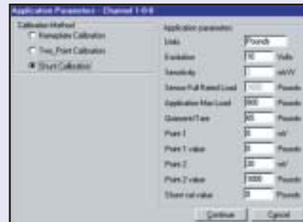
The DBK43A's software supports three calibration methods: nameplate, 2-point, and shunt

Coupling and Filtering. Each DBK43A channel features a user-selectable AC or DC coupling between the input amplifier circuits, and a selectable 3-pole, low-pass filter with user customizable cut-off frequency. Elective capacitive coupling, which is selected via user-installable jumpers, allows separation of dynamic signals from static deflection levels.